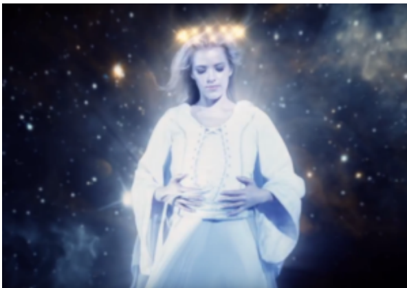
Woman Gives Birth to Man-Child in Revelation 12:2

The fact that Passover in 2014 converged with the birth of the Man-child where it fell on the Clock in Revelation Chapter 12 just 48 hours after the eclipse affirms the birth of the 144,000 Hebrew Princes on that day!