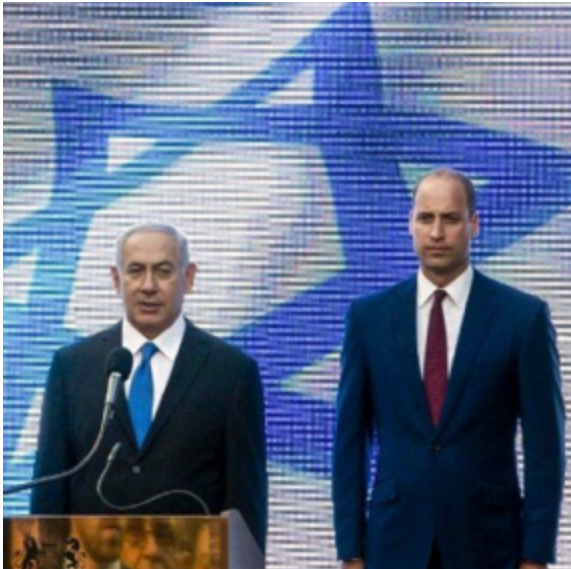
Antichrist stands with Israel's Benjamin Netanyahu

All the numbers that intersect with the Clock (not just the number 41) show William's rise to power after his 41st birthday.