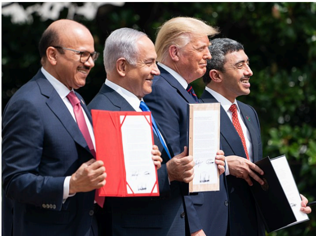
ABRAHAM ACCORD SIGNING IN 2020

Joe Biden's election just weeks after the signing swept Israel into her time of wilderness, but not before the Accords put forth by President Trump began to sustain peace in Israel for nearly 42 months before war broke out last year!