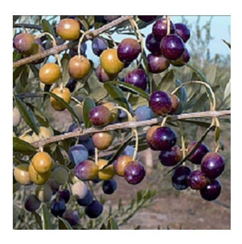
WINTER OLIVES (GROUP 4)

The resurrection of the dead (grapes) must indeed come before the in-gathering of those who are alive and remain (olives) at the end, and that is Paul's sole focus in this passage