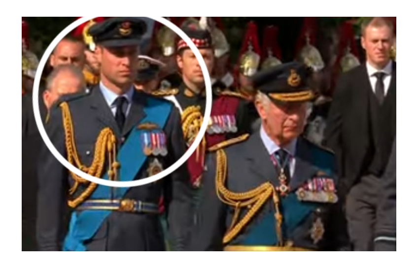
The future Antichrist stands with his father in the Queen's procession

Alternatively, William may enter into his biblical role as Prince, which may be the case if his father does not pass or abdicate the throne.